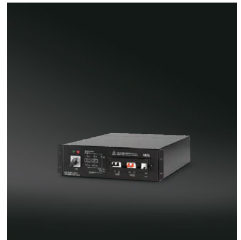
Power Distribution Box