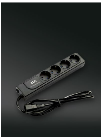
IEC Distribution Bar