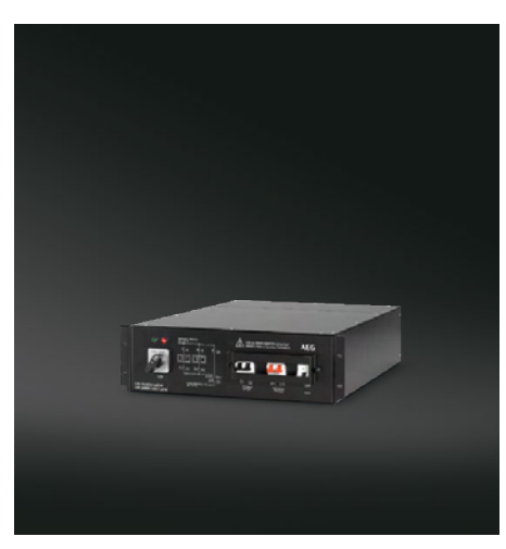
Power Distribution Box