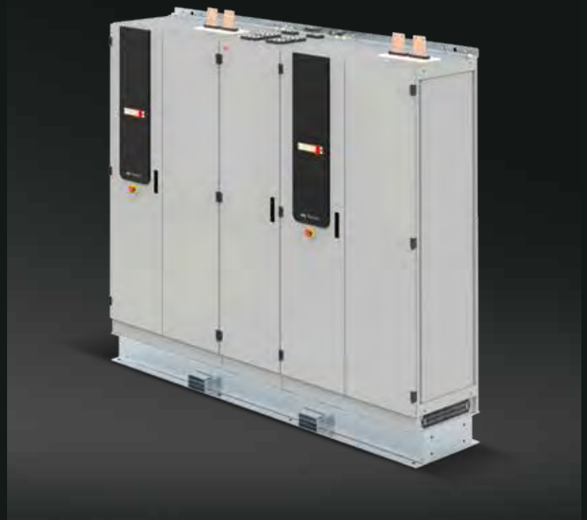
Two Thyrobbox dc 3 on baseframe with paralleling cabinet, options: DC top, water bottom, AC top